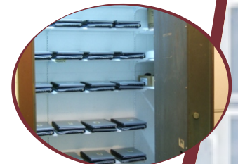
Secure storage vault